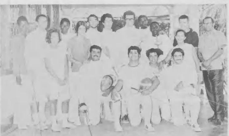
Fencing teams/Puerto Rico/Aruba/Curação